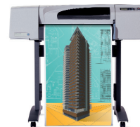
HP Designjet 500