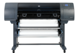
HP Designjet 4500