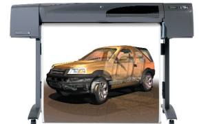
HP Designjet 800