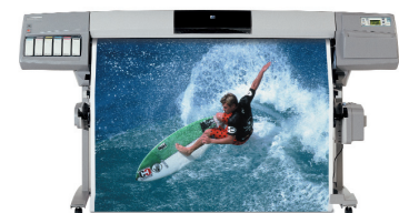
HP Designjet 5000/5500