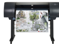
HP Designjet 4000