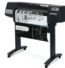
HP Designjet 1000